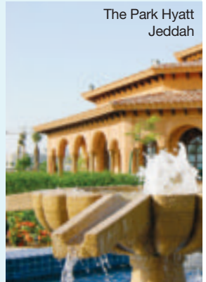
The Park Hyatt Jeddah

Horsey types are hot to trot for the new Park Hyatt Jeddah in Saudi Arabia, with its equestrian centre and exclusive members' club. But we're more keen on the resort's 4,500 sq m spa. The women's area features the region's first balneotherapy centre (which offers therapeutic bathing treatments), as well as fitness facilities, a shopping area, hair and beauty salons and indoor and outdoor pools. Log onto jeddah.park.hyatt.com for more details.