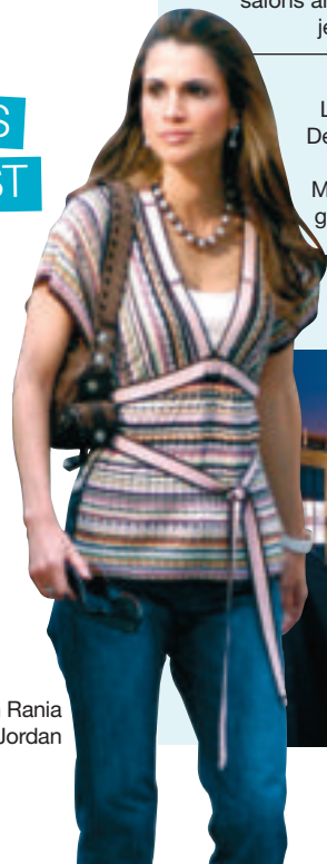
Queen Rania of Jordan

Let your cares float away with soothing Dead Sea treatments at the 10,000 sq m Anantara Spa, the largest spa in the Middle East. It's just opened at Jordan's glam Kempinski Hotel Ishtar, a favourite with Queen Rania of Jordan and Lebanese singer Nawal Al Zoghbi. For information, call +962 5 356 8888 or see kempinski-deadsea.com .