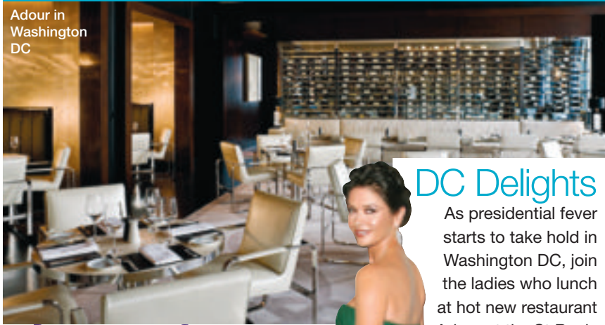
Adour in Washington DC